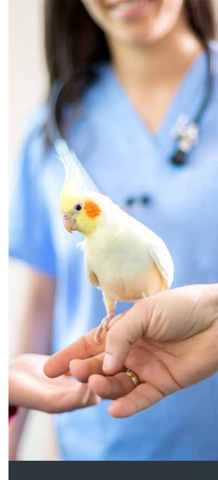
Support and onboarding is performed by a subject matter expert, available globally 24/7/365.

📀 Routine: Reports returned within 24 hours