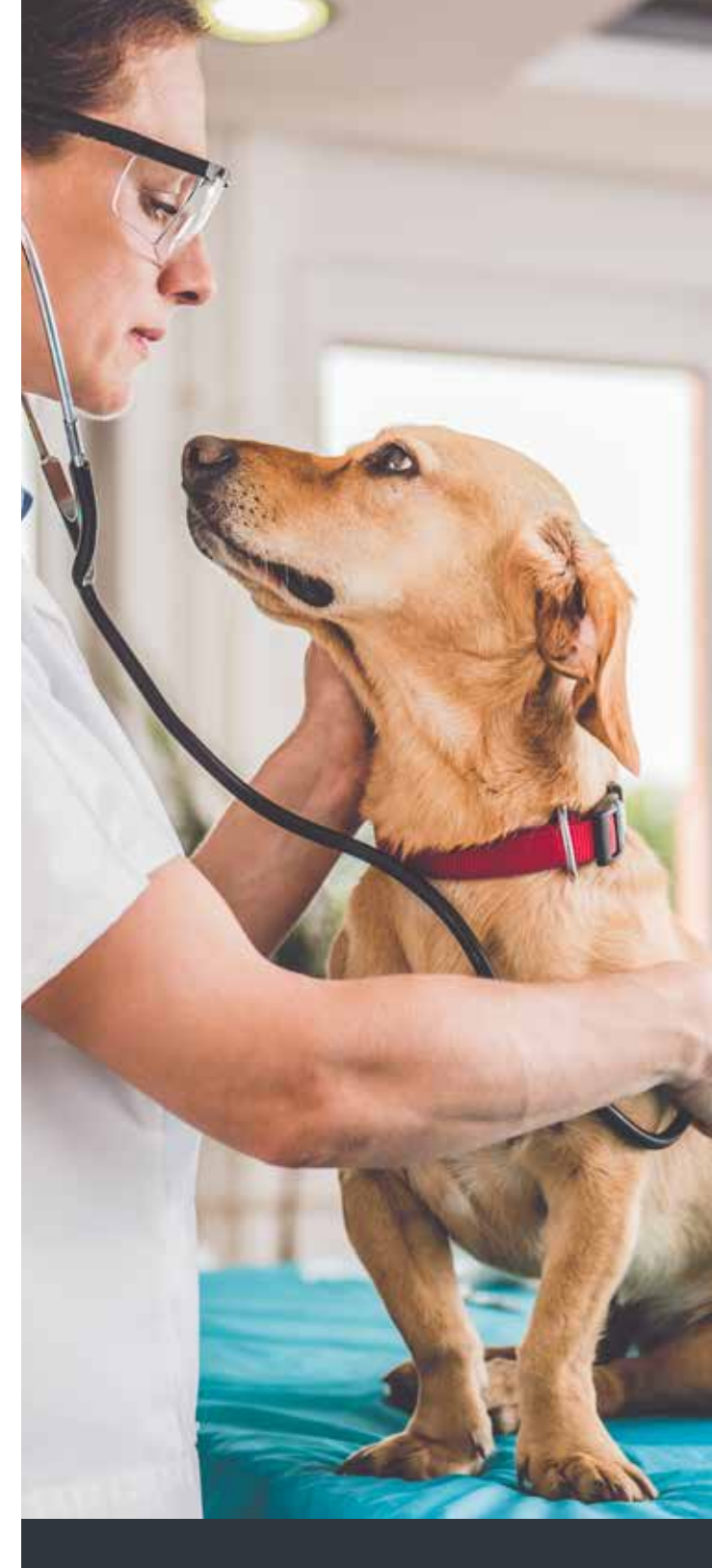
Know the estimated case turnaround time before the hospital submits a case.

ECG Screen: Reports returned within 30 minutes*